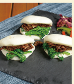
48. GUA BAO BUN $4/PC $12/3PCS

Braised pork belly Broccoli may contain peanuts