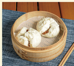
45. 8BBQ PORK BUN $4/PC