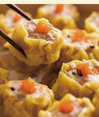
49. PORK & PRAWN SUI MAI $6.5/3PCS

Braised pork belly Broccoli may contain peanuts