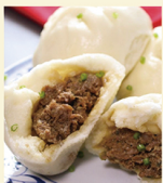
46. ORIGINAL PORK BUN $4/PC