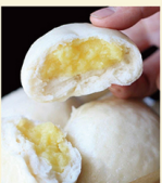
47. CUSTARD BUN $4/PC